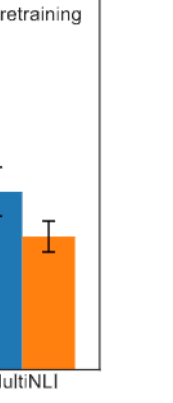
Worst-group 8 55 CelebA CivilComments